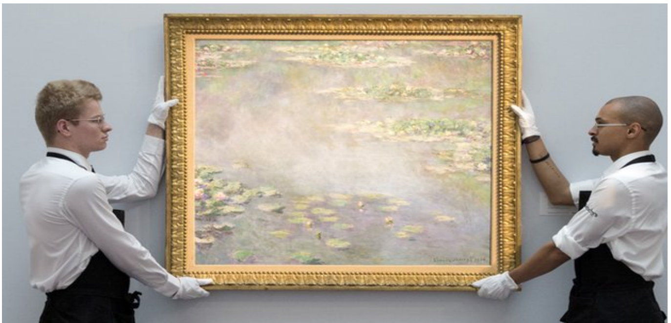
Claude Monet's water lilies painting, Nymphéas, is among his "greatest achievements"

The auction house said the bidding for the Monet work attracted buyers from Asia and all over the world and went on for 10 minutes, going up in £250,000 increments in its final stages.