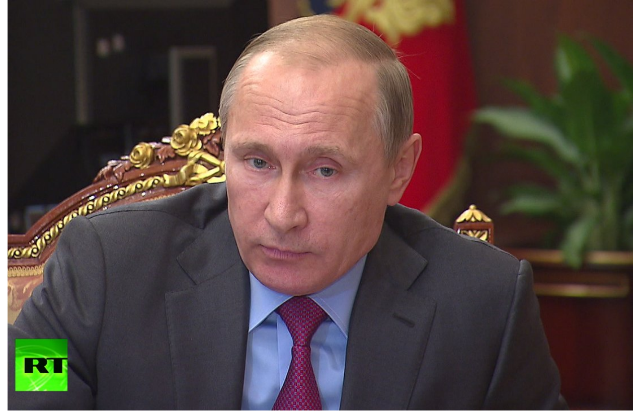
• 18:30 GMT

<u>@RT_com #Moscow</u> will keep its <u>#Hmeymim</u> airbase in <u>#Latakia</u> province - <u>#Putin</u> <u>http://on.rt.com/76wy</u> <u>#Russia #withdrawal</u>