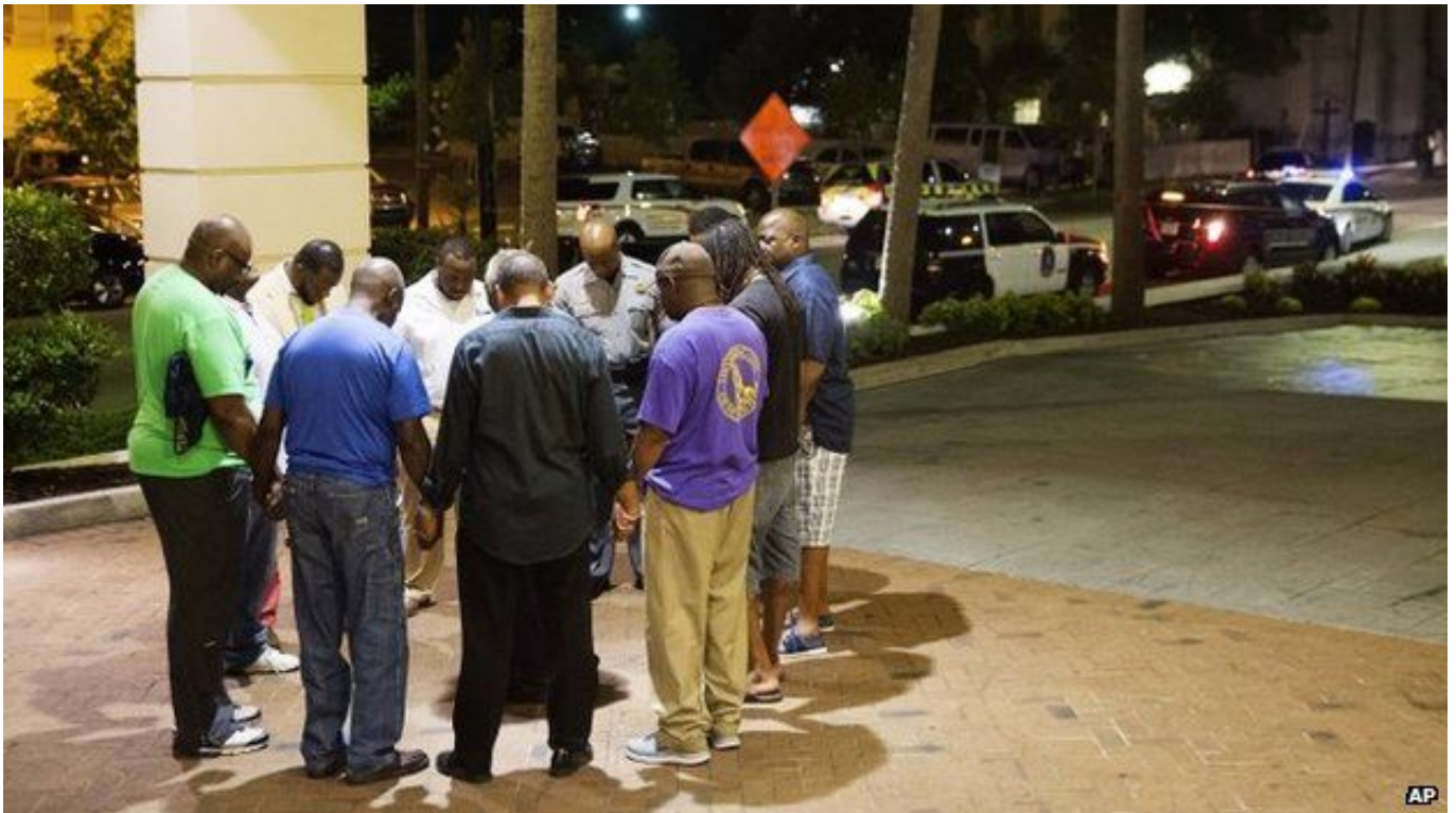
A group of worshippers later gathered nearby to pray