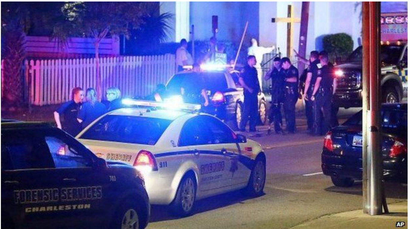
Police say they are searching for a white male suspect in his 20s

The weekly bible study meeting was under way in the church on Calhoun Street when the shooting unfolded at about 21:00 local time (01:00 GMT Thursday).