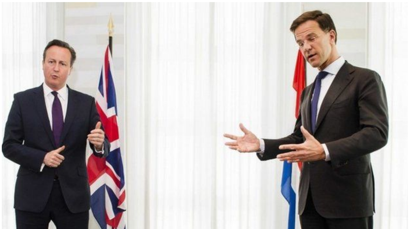
The prime minister also held talks with his Dutch counterpart, Mark Rutte

After Mr Cameron's breakfast meeting with Polish Prime Minister Ewa Kopacz, Downing Street said the UK and Poland agreed on the need for more powers for national parliaments and for countries outside the eurozone to be treated fairly in the event of closer integration within the single currency bloc.