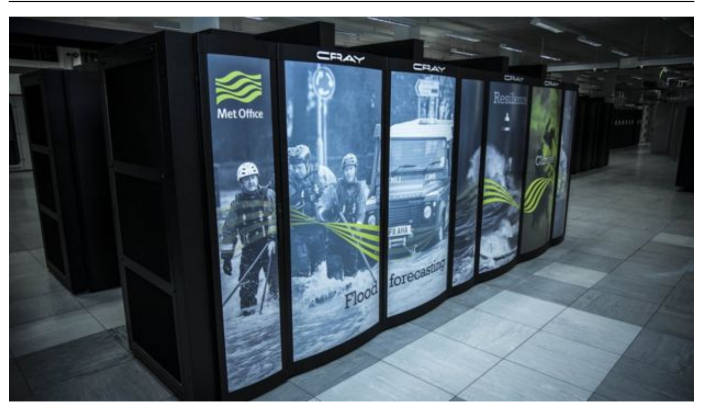
The Met Office's existing supercomputer

And working out if a summer downpour will flood your home or one down the road requires more and more processing power.