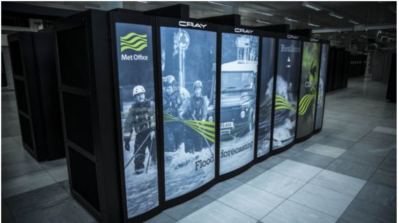
Met Office / The Met Office's existing supercomputer

And working out if a summer downpour will flood your home or one down the road requires more and more processing power.