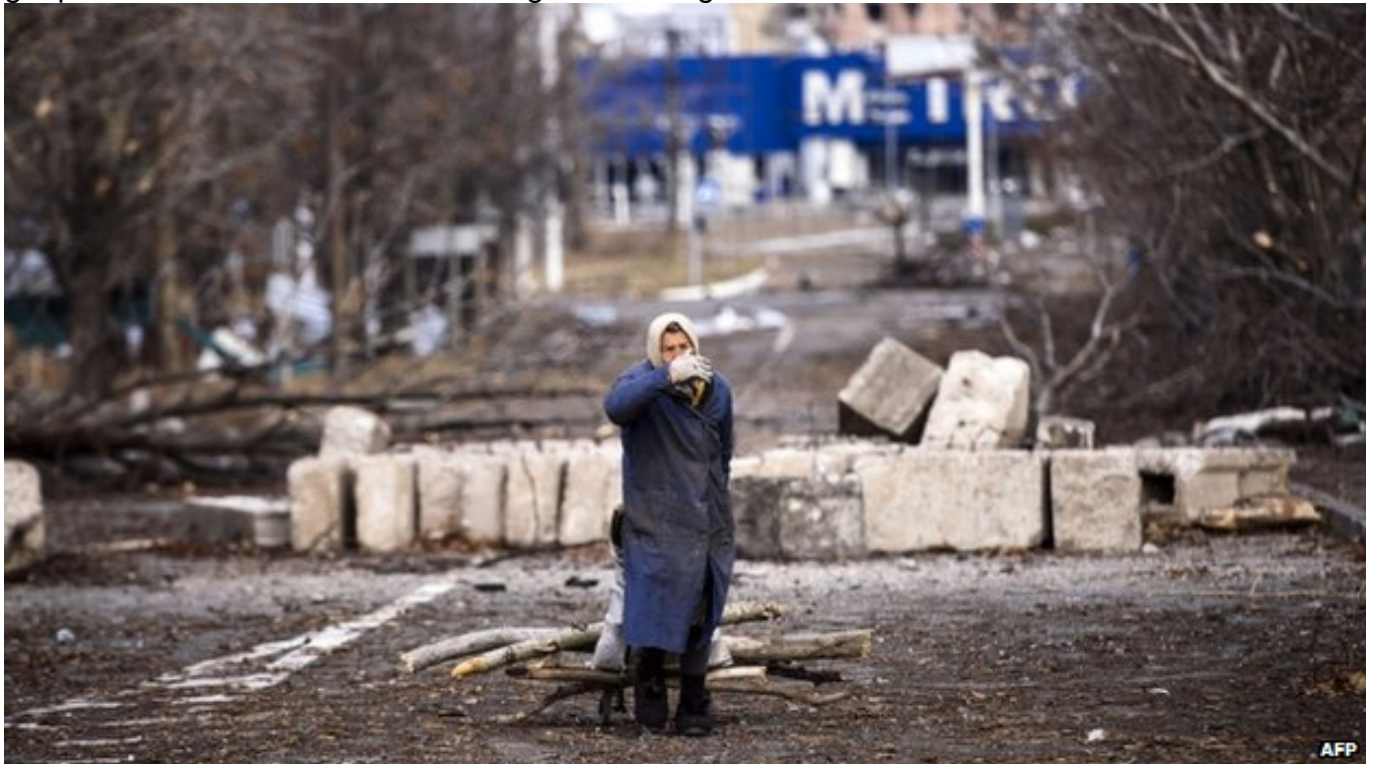
Months of fighting have devastated the Donetsk and Luhansk regions

He described the 2 November "pseudo-elections" in Donetsk and Luhansk as a "farce at gunpoint" which would never be recognised as legitimate.