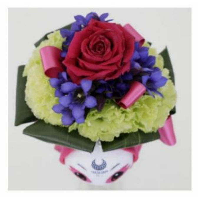
Bouquet for the Paralymnic Games

Tokyo 2020 has announced that flowers grown in areas affected by the 2011 Great East Japan Earthquake will be used in the bouquets presented to medallists at next year's Olympics and Paralympics.