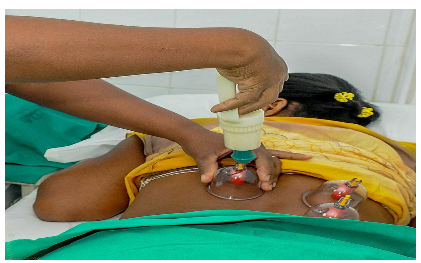
Among Natural and Traditional Medicine treatments offered in Cuba.