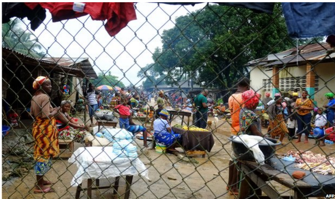
As part of the quarantine in Dolo Town walk-in centres were opened for temperature checks and other measures