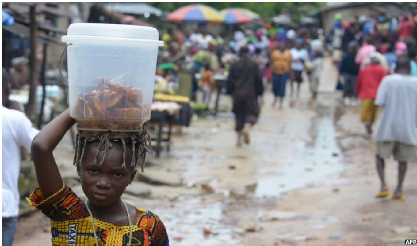
Dolo Town near the Liberian capital of Monrovia has been quarantined as a measure to contain Ebola