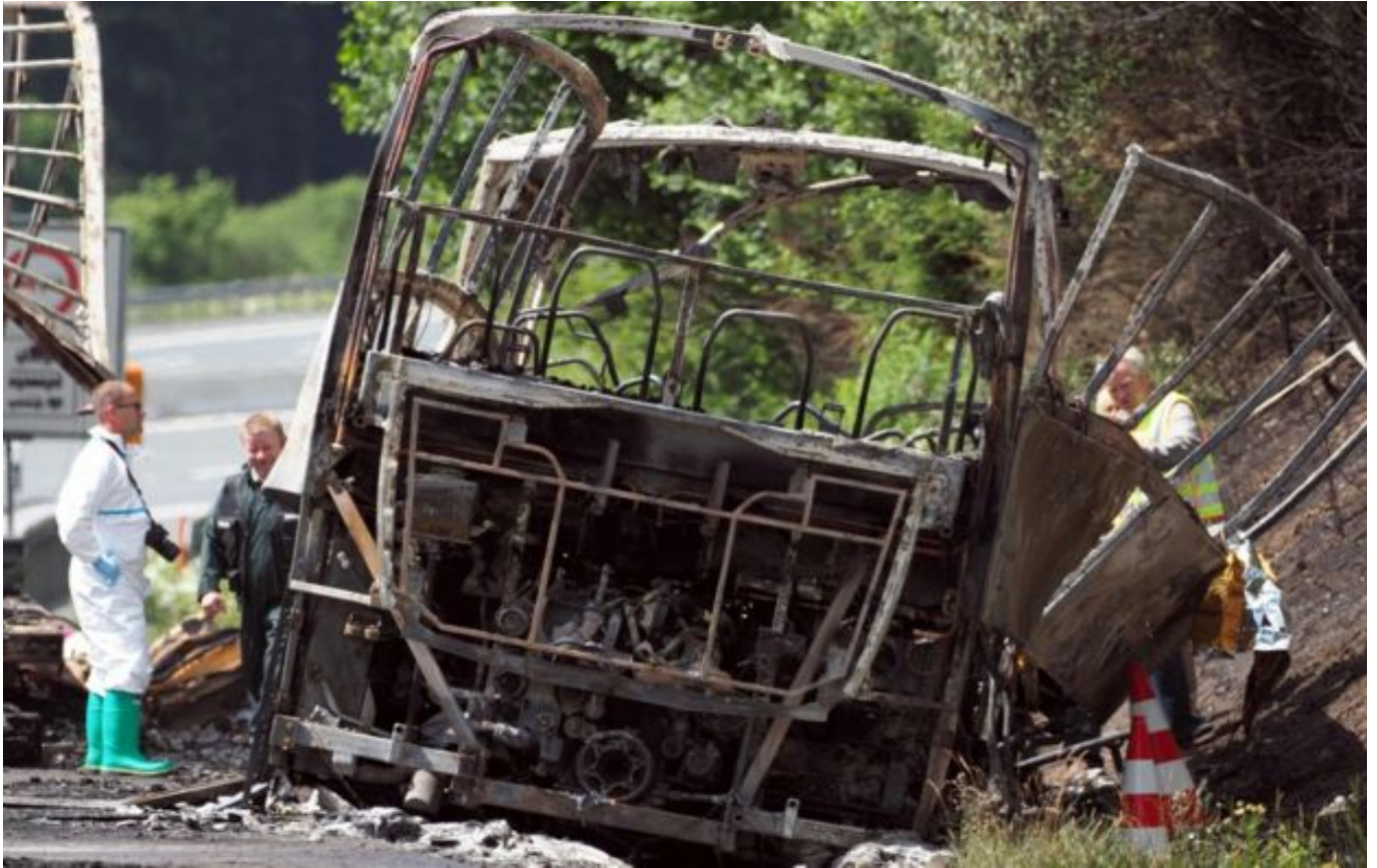
Forensic experts are examining the charred skeleton of the bus and human remains inside