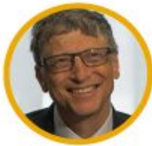
$75bn Bill Gates