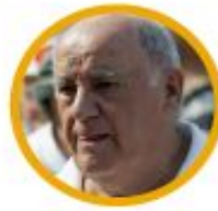
$67bn Amancio Ortega