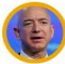
$45bn Jeff Bezos