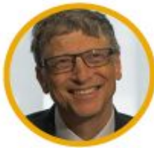
$75bn Bill Gates