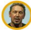
$44bn Larry Ellison