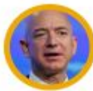
$45bn Jeff Bezos