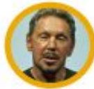
$44bn Larry Ellison