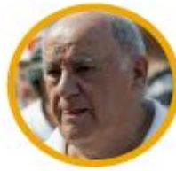
$67bn Amancio Ortega