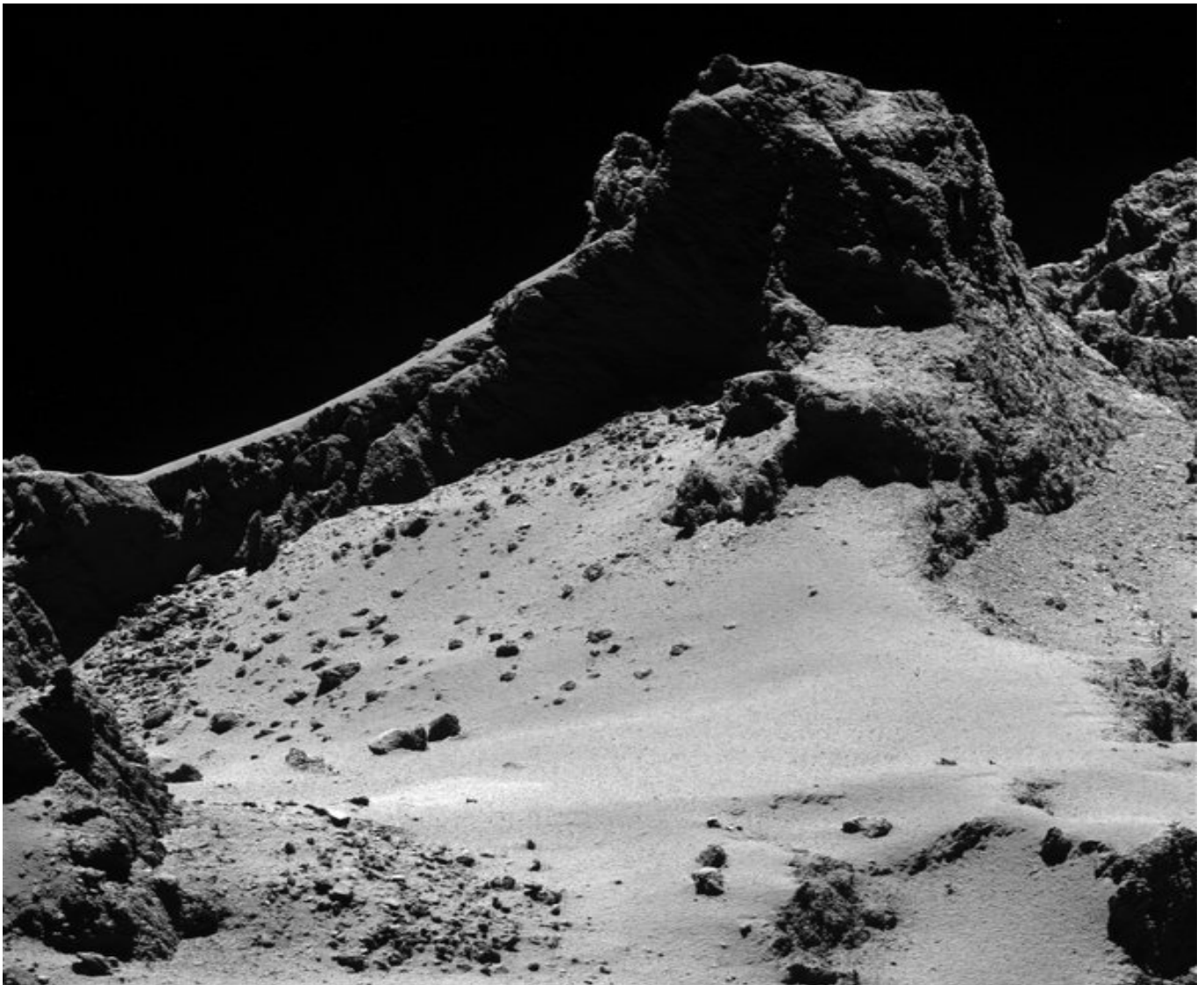
A close-up of the "neck region" of the rubber-duck-shaped comet.

In mid-December, the orbiter's high-resolution camera took pictures of the spot where the scientists think the lander ended up, but the scientists were not able to find it — a few pixels in a four-million-pixel image.